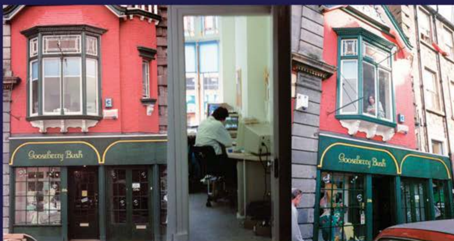
DMA Design's First Office